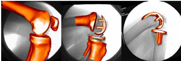
Figure 1 – Models of bones or implants can be registered with their radiographic projections to provide a measure of dynamic 3D motion.

markers affixed to the skin surface and tracked using optical photogrammetry. These techniques are sufficient to define the kinematics of highly conforming joints like the hip, but are insufficient to define the translations and rotations that occur in the knee due to motion of the skin affixed markers with respect to the bones. We introduced radiographic observation techniques in 1992 that permit 3D measurement of implant and bone motion during dynamic activities (Figure 1). We and many others world-wide, now use either marker-based motion capture or radiographic techniques to define in vivo hip and knee kinematics for a wide variety of activities.